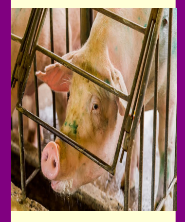
Separated by steel bars

95% of pigs in the US live on factory farms